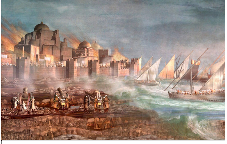
Constantinople being bombarded by Muslim cannons.

Forty-six days later the "Judas" cannon and other weaponry allowed the Muslims to breach the walls and gates, and the besiegers came bursting in from all sides. An eyewitness of the event described it thus: "At this moment of confusion, which happened at sunrise, our omnipotent God came to His most bitter decision and decided to fulfill all the prophecies, as I have said, and at sunrise the Turks entered the city near San Romano, where the walls had been razed to the ground by their cannon ... anyone found was put to the scimitar, women and men, old and young, of any conditions." This butchery lasted for 3 days accompanied by unspeakable excesses of cruelty and debauchery.